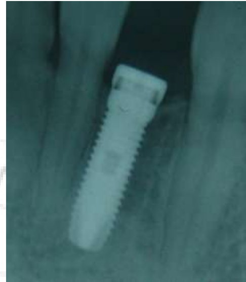
Figure 5: Periapical X-ray of implant affected by peri-implantitis.

Peri-implantitis, like periodontitis, is an endogenous polymicrobial and opportunist infection, that appears by the combined action of local microbiome [7], resulting from the disequilibrium between bacteria and host response, that can lead to local inflammation or bone loss, and sometimes to implant loss [8].