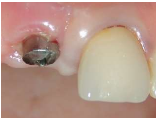
Figure 3: Second surgical step, 11 th region, installed healer.

Several studies demonstrate biofilm formation on dental implants. Koka et al. [26], in a study with partially edentulous patients, suggested that colonization of marginal implant plaque occurred within 14 days, whereas subgingival colonization took longer and occurred within 28 days (Figure 3) [26].