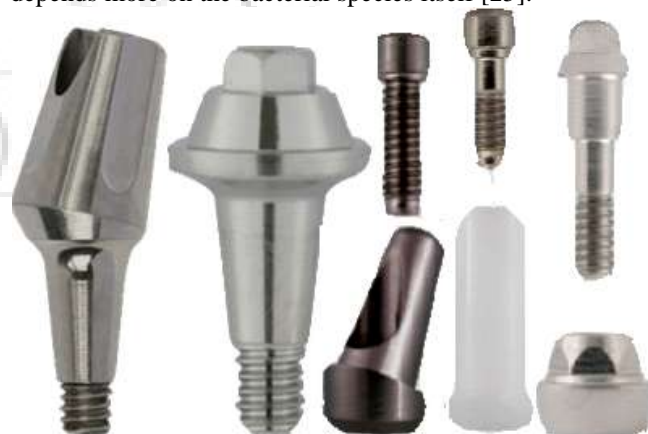
Figure 2: Examples of prosthetic abutments.

Prosthetic components (Figure 2) are mostly made up of metal, however, and for aesthetic reasons, other materials have been introduced in the prosthetic components of dental rehabilitations like zirconia oxide [22]. Differences in microbial colonization between ceramic and metal surfaces are still a controversial issue, as some in vitro studies point out that microbial colonization in zirconia oxide surfaces is lower when compared with titanium surfaces [23,24] and others verified that the predominant factor for adhesion depends more on the bacterial species itself [25].