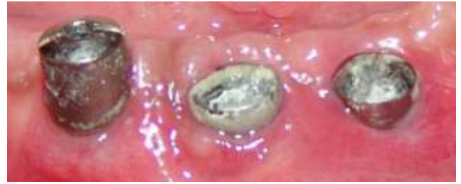
Figure 4: Mucositis spots.

Bacterial colonization around dental implants can lead to some local diseases, being the most common, mucositis and peri-implantitis. Mucositis (Figure 4) is an inflammation restricted to peri-implant mucosa in the implant, without bone loss. Peri-implantitis (Figure 5) is a deep inflammatory lesion, characterized by bleeding, peri-implant pocket and progressive loss of bone support around implants. These two forms of infection resemble respectively gingivitis and periodontitis in teeth [7,8].