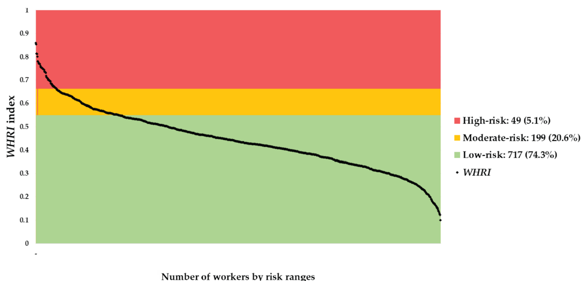
Figure 2. WHRI risk range by workers' number and relative frequencies (%)

The WHRI was applied in the study sample (965 workers). Figure 2 shows the distribution of the percentage of workers in each risk range.