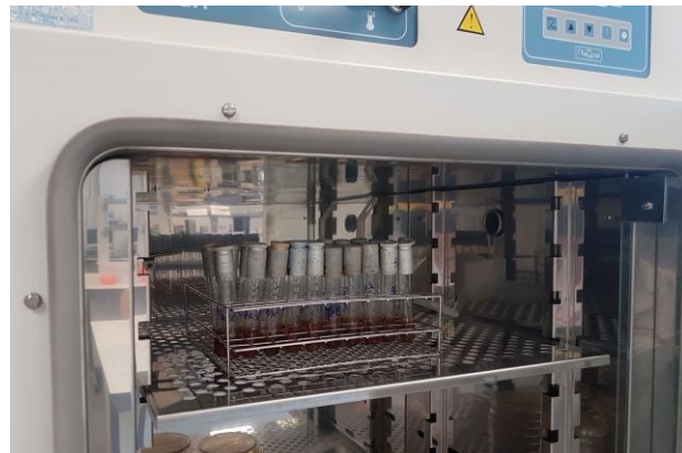
Figure 3 – Gutta-Percha points incubated at 37 °C