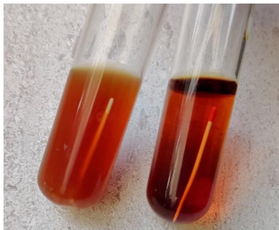
Figure 4 – Representation of a contaminated Gutta-Percha point (left Eppendorf tube) against an uncontaminated one (right Eppendorf tube)