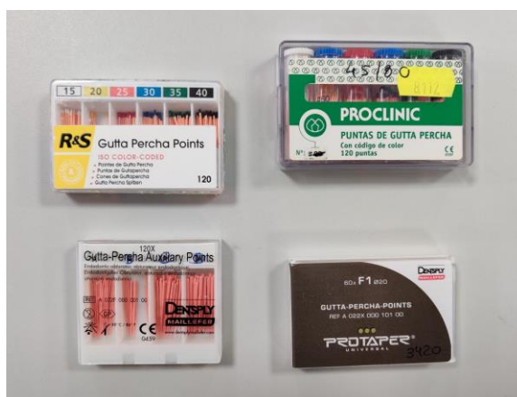
Figure 1 – Different brands of Gutta-Percha points

For the accomplishment of this study, we analyzed 240 points of GP of different trademarks (Dentsply® Sirona, Ballaigues, Switzerland; Proclinic®, Zaragoza, Spain; ProTaper Universal®, Dentsply, Switzerland; R & S, Tremblay-en-France, France) and of different ISO gauges (A, B, C, D, K15, K20, K25, K30, K35, K40, F1, F2, F3). (Figure 1)